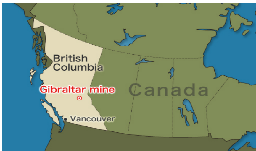
Location of the Gibraltar Copper Mine

Sojitz Corporation, Furukawa Co., Ltd. (Furukawa) and Dowa Metals & Mining Co., Ltd. (Dowa), a subsidiary of Dowa Holdings Co., Ltd., reached an agreement with Taseko Mines Limited, a Canadian copper mining firm, to acquire 25% of the Gibraltar copper mine for approximately C$187 million (approximately 15.9 billion yen at an exchange rate of 85 yen per Canadian dollar). The Gibraltar copper mine is located in Williams Lake, British Columbia, about 600 km north of Vancouver.