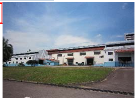
Exterior of plant at DOWA ECO-SYSTEM SINGAPORE